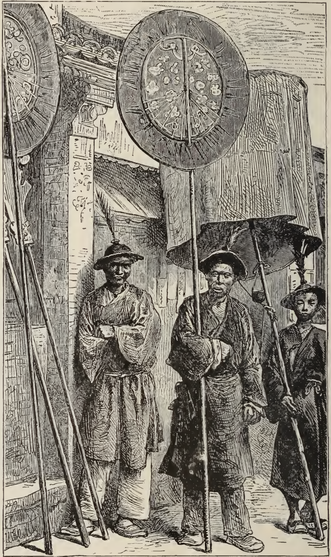
HIRED MOURNERS FOR FUNERAL PROCESSIONS.